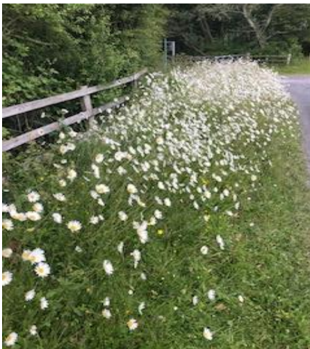
Ox eye daisies