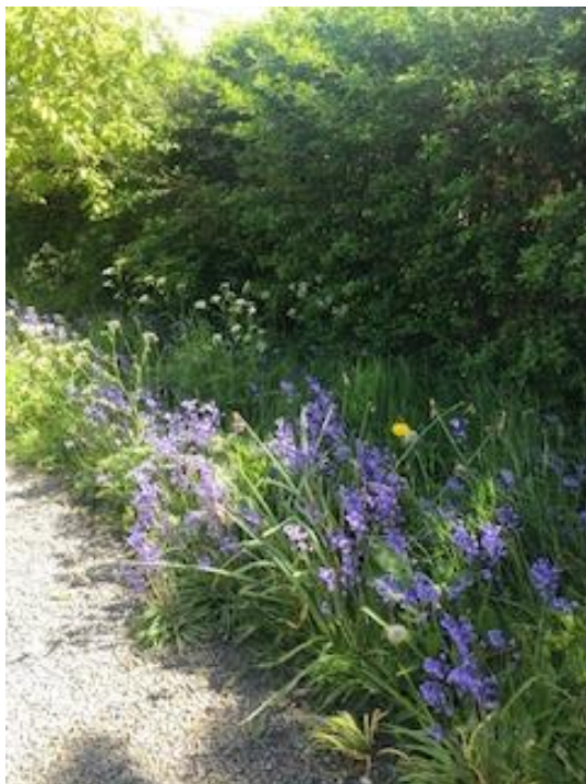
Spring bluebells helping our early pollinators and brightening the verges