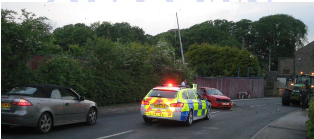
Accident on Lancaster Road

Future meetings will be held on Wednesday, 13 th August, 10 th September and 8 th October, 2014